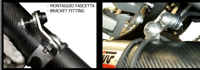
- MONTAGGIO FASCETTA - BRACKET FITTING